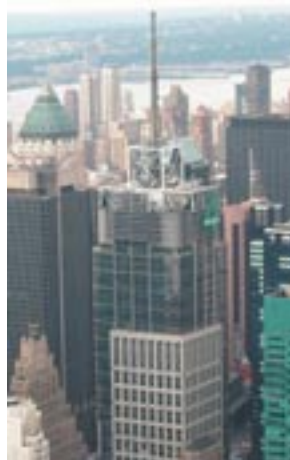
Conde Nast Building, Manhattan, 6 June 2010.

Sun and Sky House , a sustainable “green” custom home we designed last